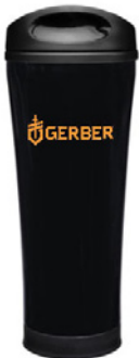
TRAVEL COFFEE MUG